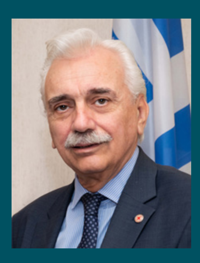
the international humanitarian principles it has upheld and defended since 1877.

We would like to express our warmest thanks to the Greek people for their immediate humanitarian, altruistic and touching response to our call for aid, establishing the HRC as the main recipient of love and solidarity towards the victims of the devastating war. We are determined to continue to provide all kinds of humanitarian aid to those affected even after the end of the war, as prescribed by the Red Cross ideals and the firm commitment of the Hellenic Red Cross to